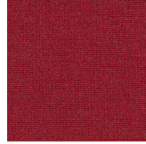
Fabric MF - Main Line Flax / Camira Available colours 10