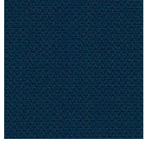
Fabric AL - Alba / FiDiVi Available colours 10