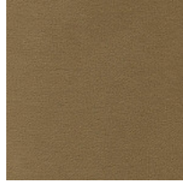
Fabric RG - Regent / Camira Available colours 10