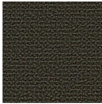
Fabric YO - Yoredale / Camira Available colours 10