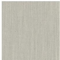
Fabric FD - Fiord 2 / Kvadrat Available colours 7