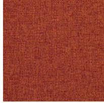
Fabric ME - Medley / Gabriel Available colours 15