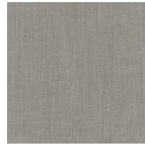
Fabric RM - Remix 3 / Kvadrat Available colours 10