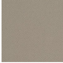
Fabric ST - Step / Gabriel Available colours 10