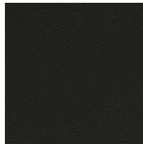
Coated fabric SC - Secret / Flukso Available colours 3

Questo prodotto è garantito 5 anni. Sitland Spa si riserva di apportare modifiche e/o migliorie di carattere tecnico ed estetico ai propri modelli e prodotti in qualsiasi momento e senza preavviso. Le foto e i colori visualizzati sono puramente indicativi e possono variare rispetto alla realtà. Per maggiori informazioni si prega di contattare il nostro Servizio Clienti service@sitland.com