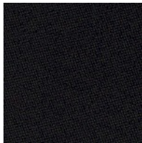
Fabric CH - Chili / Gabriel Available colours 10