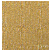
Fabric FT - Foster / Vescom Available colours 7