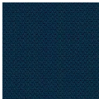
Fabric AL - Alba / FiDiVi Available colours 10