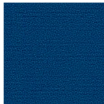
Fabric BN - Bondai / FiDiVi Available colours 10