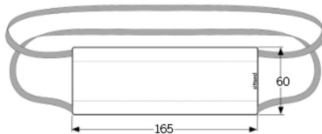
Misure mascherina (da indossare) Mask measurements (to wear)